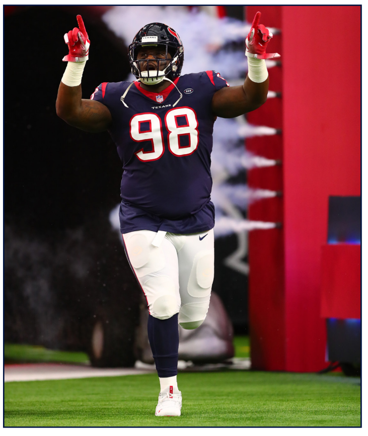
The Texans drafted DE/NT D.J. Reader in the fifth round (166th overall) of the 2016 NFL Draft. Reader has played in 46 games (37 starts) and compiled 102 total tackles (53 solo), 4.0 sacks, 11 quarterback hits, 10 tackles for loss and one pass defensed. Reader has also started three postseason games and recorded 1.0 sack in a Wild Card game against Oakland on Jan. 7, 2017.